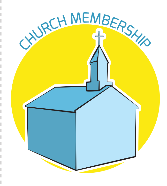
Adoption Card Pattern 1 of \,2\,