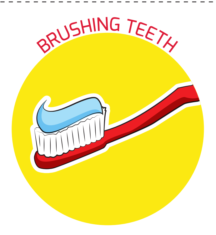
©2017 The Christian Broadcasting Network, Inc. Superbook® and the Superbook logo are registered trademarks of The Christian Broadcasting Network, Inc. The characters in Superbook including Joy, Chris and Gizmo are trademarks of The Christian Broadcasting Network, Inc. All rights reserved.