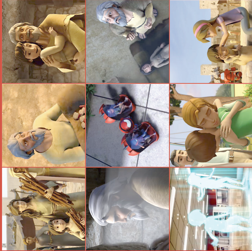
ELIJAH AND THE WIDOW

Can you find these things in the video? Mark off each that you see. If you get three in a row, shout "GIZMO!"