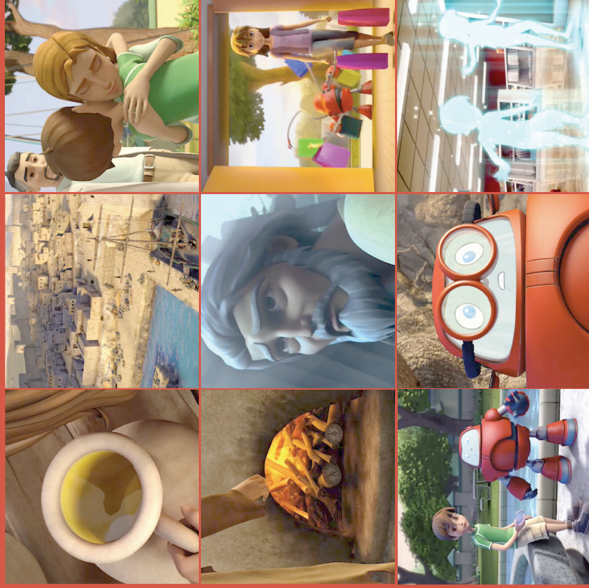
ELIJAH AND THE WIDOW

Can you find these things in the video? Mark off each that you see. If you get three in a row, shout "GIZMO!"