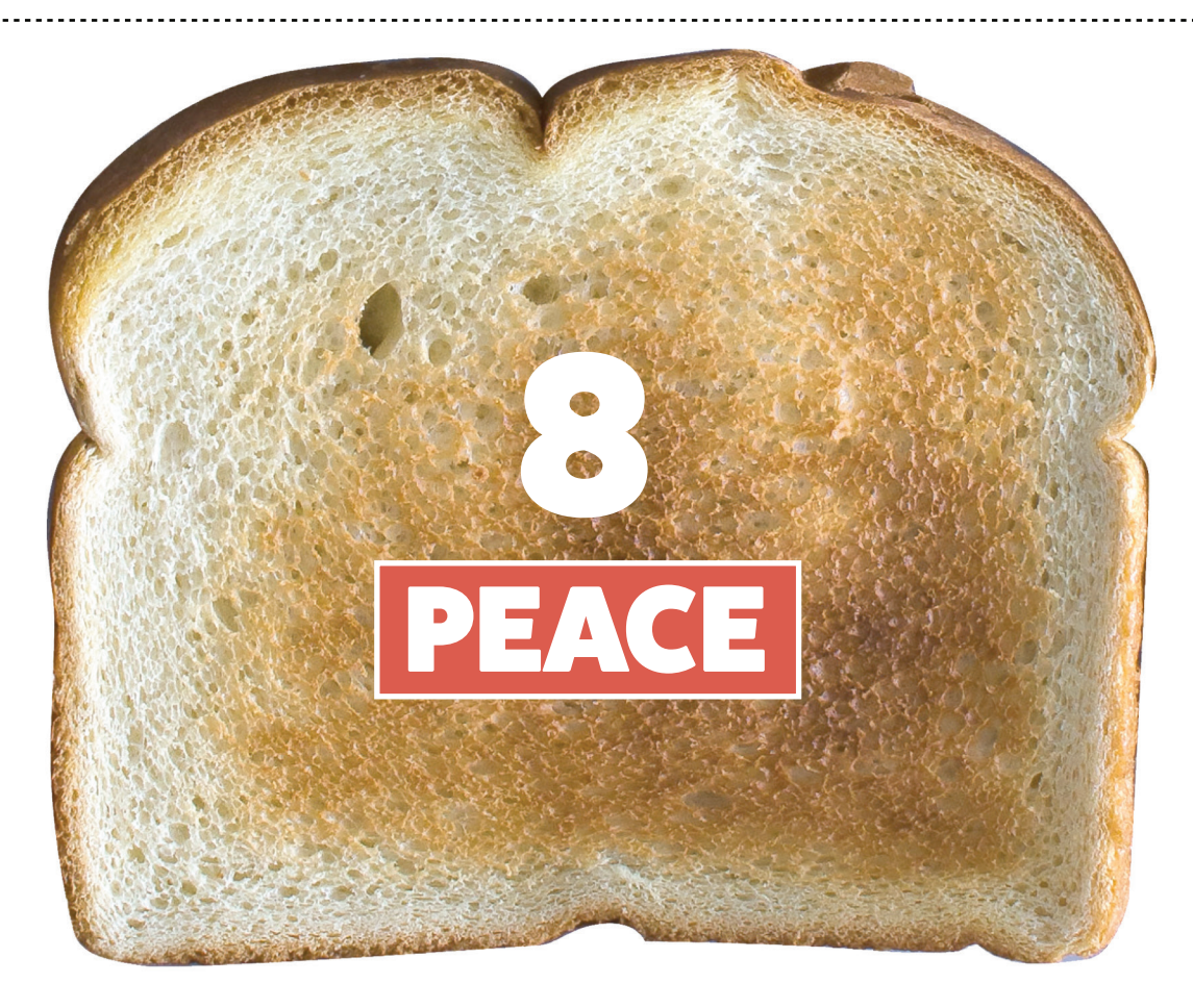
Teach Us to Pray Lesson 1 of 3 Superbook Academy