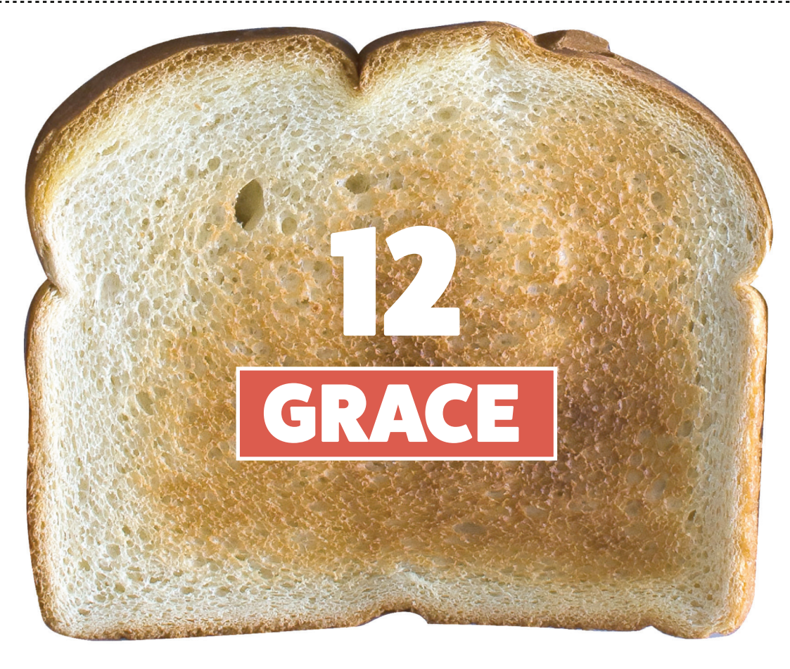
Teach Us to Pray Lesson 1 of 3 Superbook Academy