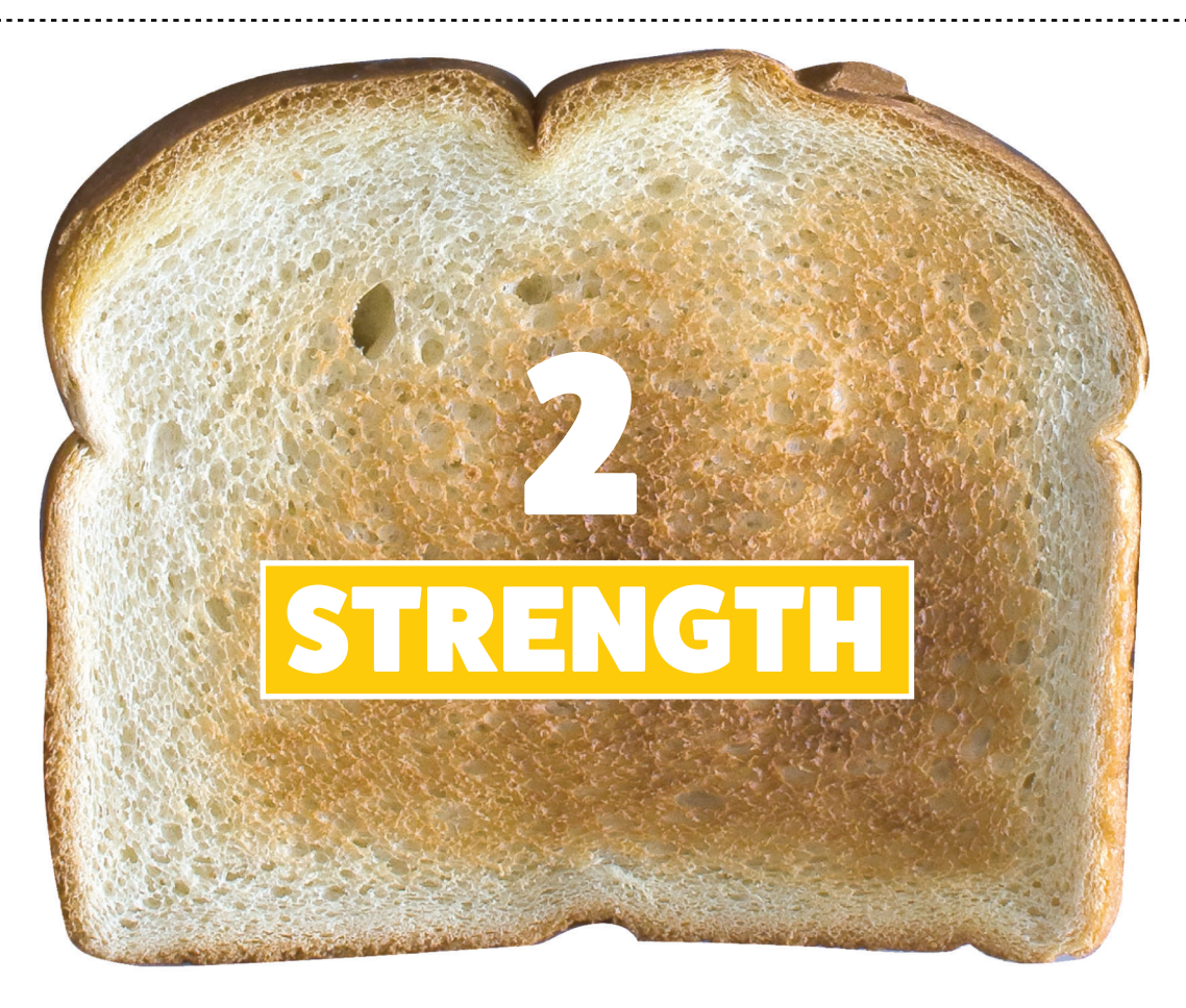
Teach Us to Pray Lesson 1 of 3 Superbook Academy