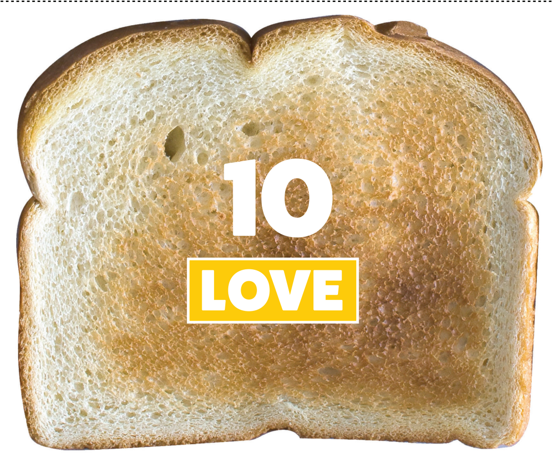
Teach Us to Pray Lesson 1 of 3 Superbook Academy

©2018 The Christian Broadcasting Network, Inc. Superbook® and the Superbook logo are registered trademarks of The Christian Broadcasting Network, Inc. The characters in Superbook including Joy, Chris and Gizmo are trademarks of The Christian Broadcasting Network, Inc. All rights reserved.