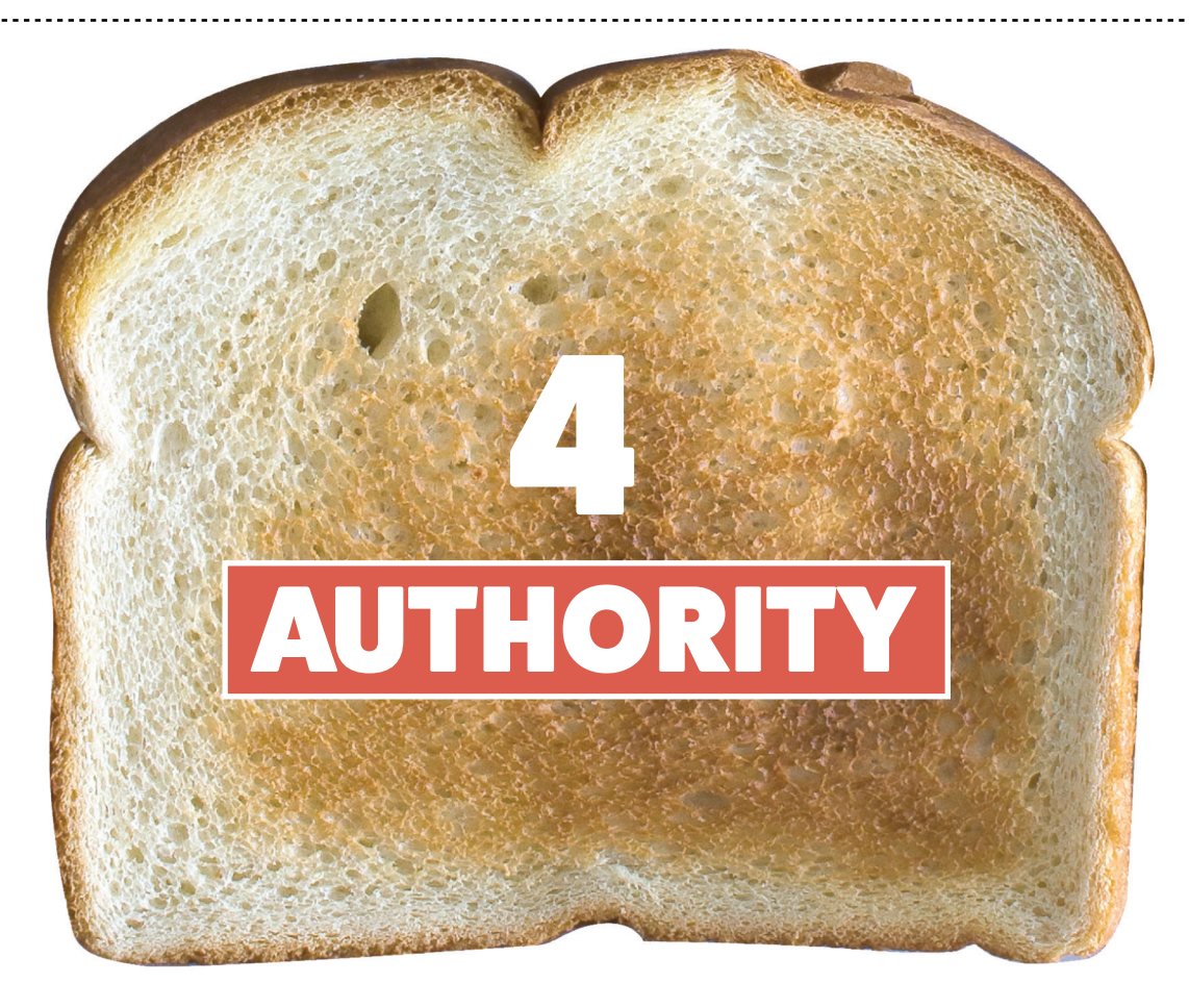
Teach Us to Pray Lesson 1 of 3 Superbook Academy